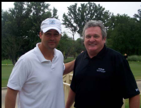
Hosts Kyle Chandler and Brad Leland